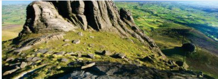
AONB and Geopark Interactive Map

Care has been taken to ensure accuracy in the compilation of this map at the time of publication. Newry, Mourne and Down District Council cannot, however, accept responsibility for errors and omissions. Where such are brought to our attention, the amendment of any future publications as appropriate shall be entirely at our discretion.